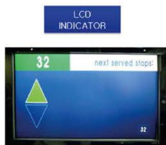
CAR : 7.4" TFT LCD INDICATOR HALL : 4.3" TFT LCD INDICATOR

* Display mode is changeable * Registered floors display.