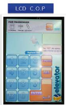
10.4" LCD Touch COP(10 keys)

Microprocessor based V3F Controller expandable up to 32 bits smooth start and stop, power saving features, troubleshooting made easy, special features as per customer requirements, parallel and serial configurations, group control up to 8 cars, custom built controllers for MRL, IP Degree Protection (if required), Voice synthesizers as per the needs and requirements of the buyers.